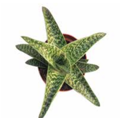
Aloe Variegata Magic