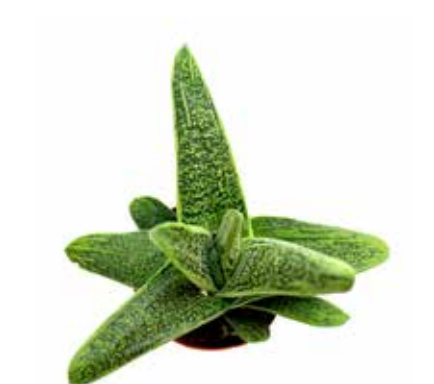
Gasteria Little Warty