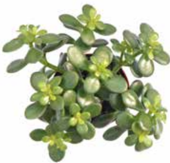
Crassula Minor Double