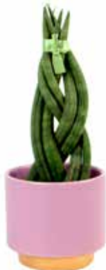
Sansevieria Braid 3" Ceramic Upgrade