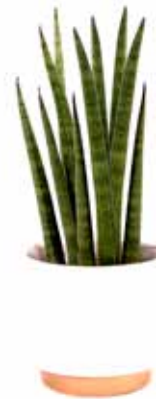
Sansevieria Rocket 3" Ceramic Upgrade