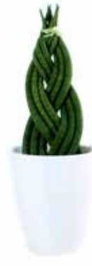
Sansevieria Braid 5.5" Ceramic Upgrade