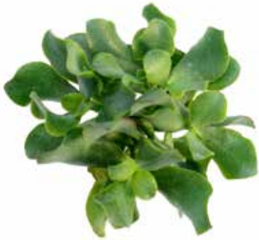
Crassula Curly Gray