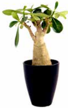
Adenium Arabicum 5.5" Ceramic Upgrade