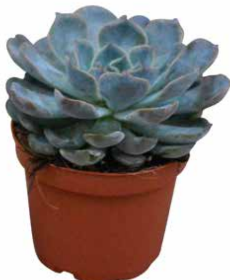
5" - PACK 8