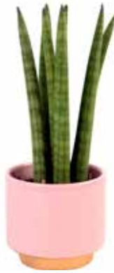
Sansevieria Spaghetti 3" Ceramic Upgrade