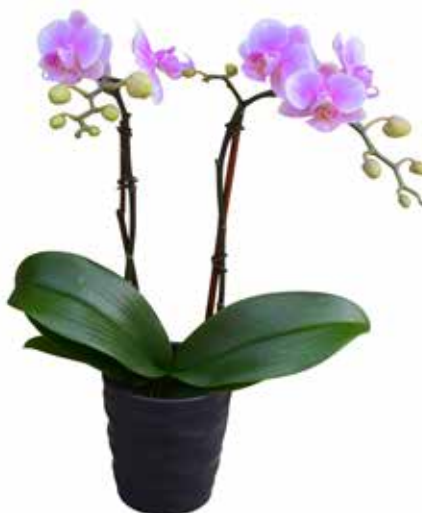
4" Mini Orchid