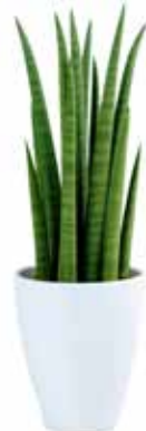
Sansevieria Rocket 5.5" Ceramic Upgrade