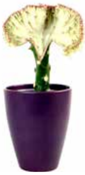
Euphorbia Lactea 5.5" Ceramic Upgrade