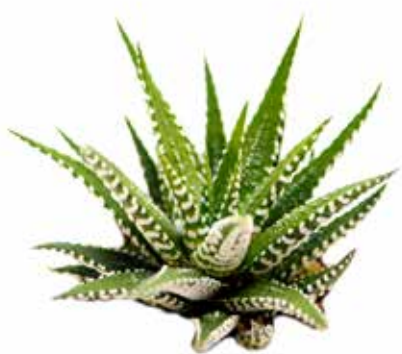
Hawthoria Blg Band