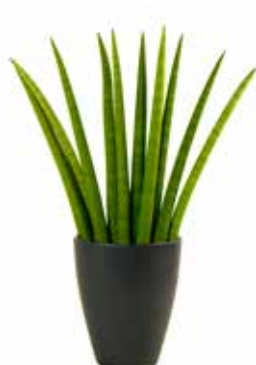
Sansevieria Fan 5.5" Ceramic Upgrade