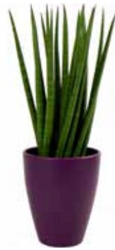
Sansevieria Spaghetti 5.5" Ceramic Upgrade