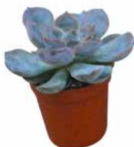
2" - PACK 28

Pure Succulents are offered in standard grower pots and in three distinct sizes. All sizes are available to ship in trays of straight varieties.