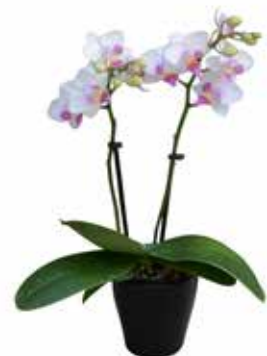
3" Micro Mini Orchid