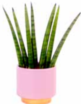
Sansevieria Fan 3" Ceramic Upgrade