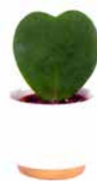
Hoya Kerrii 3" Ceramic Upgrade

All EasyCare varieties are available in plastic grower pots.