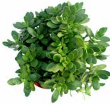
Crassula Money Maker