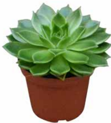
3.5" - PACK 18